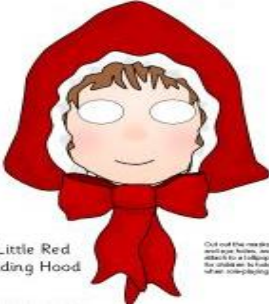
Little Red Riding Hood

Cut out the mask and eye holes, and attach to a lollipop stick for children to hold when role-playing.